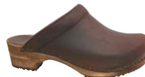
Chrissy // 1200009W // Size 35-42 Christian // 1200009M // Size 40-48 Oil Leather // 78 Ant. Brown