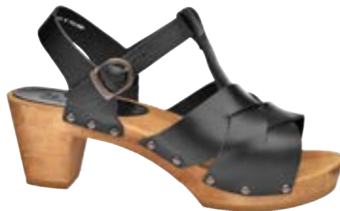
Falo // 478305 Pull Up Leather // 2 Black // Size 35-42