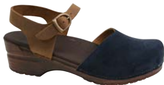
Sanos // 476248 // Suede/Oil Leather 5 Blue // Size 35-42