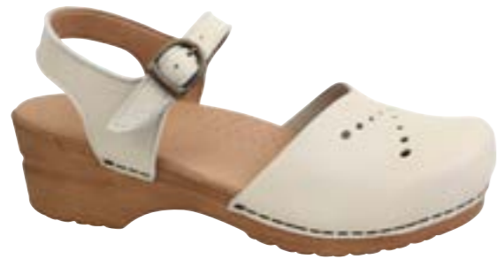
Sella // 474148 // Leather 1 White // Size 35-42

A wide range of soft comfort styles are incorporated in the sandal range for SS23. Oiled leather, coated leathers or suedes in combination with the shock absorbing polyurethan platform sole and ergonomic fitted footbed comforting and cushioning the foot all day.