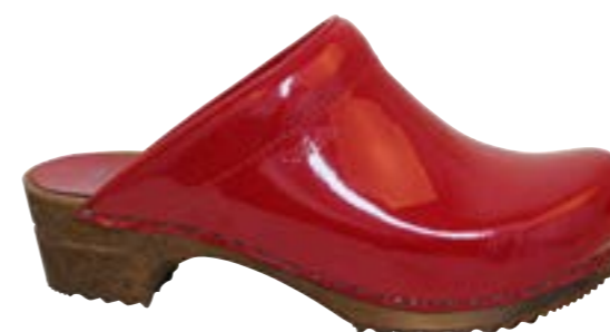
Classic Patent // 457012 // Patent Leather 4 Red // Size 35-42