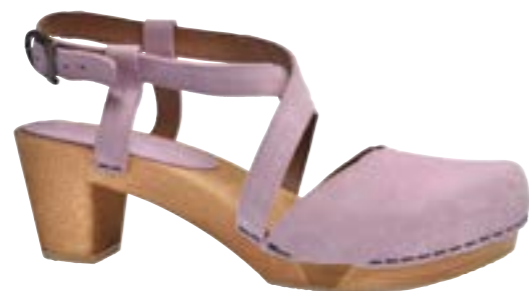
Linja Flex // 474107 Suede // 59 Light Purple // Size 35-42