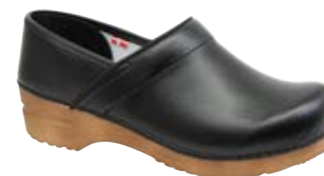
Pila // 476006 // PU Leather 2 Black // Size 35-42