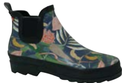
Felicia Welly // 467987 // Natural Rubber 29 Navy Leaf // Size 36-42