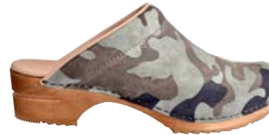
Soldi // 477109 // Printed Suede 43 Olive Camouflage // Size 35-42