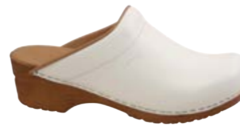
Sandra // 473047 // PU Leather 1 White // Size 35-42

Our wooden sole design turned into a soft comfortable PU (Polyurethane) sole with a wooden look. Extra comfortable with soft padded footbed cushioning the foot.