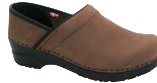
Original-Prof. Textured Oil // 450206W // Size 35-43 Original-Prof. Textured Oil // 450206M // Size 40-48 WR Oil Leather // 78 Ant. Brown