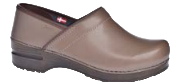
Izabella // 457006W // PU Leather 24 Taupe // Size 35-43