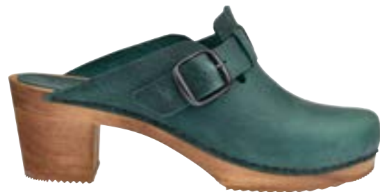
Malulo // 476200 // Oil Leather 77 Dark Green // Size 35-42