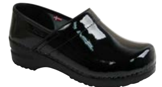
Original-Prof. Patent // 457406W Patent Leather // 2 Black // Size 35-43