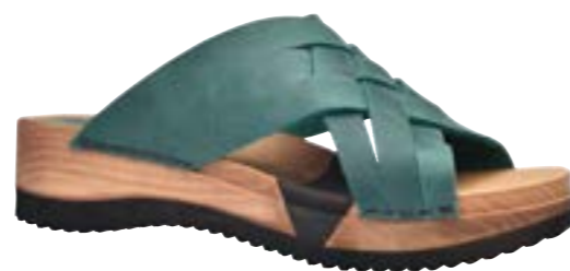
Salto Flex // 476220 Oil Leather // 77 Dark Green // Size 35-42