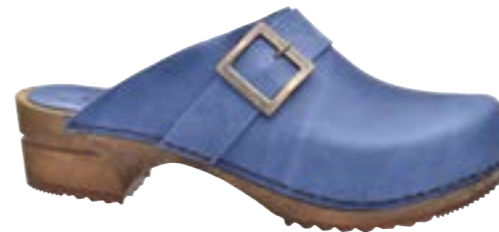
Urban // 453062 // Oil Leather 92 Dove Blue // Size 35-42