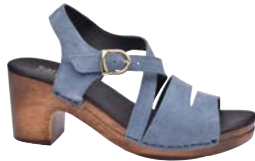
Non Wood Sefica // 478762 Suede // 92 Dove Blue // Size 35-42