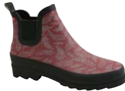
Felicia Welly // 467987 // Natural Rubber 47 Bordeaux // Size 36-42