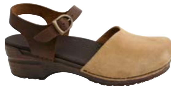
Sanos // 476248 // Suede/Oil Leather 24 Sand // Size 35-42