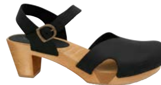
Matrix Flex // 451207 Oil Leather // 2 Black // Size 35-42