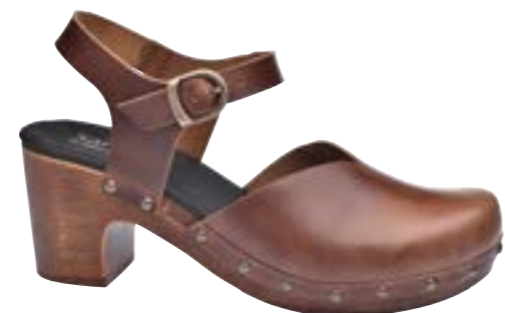
Non Wood Solaima // 478764 Leather // 3 Brown // Size 35-42