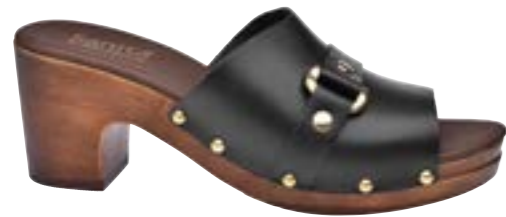
Non Wood Seia // 478763 Leather // 2 Black // Size 35-42