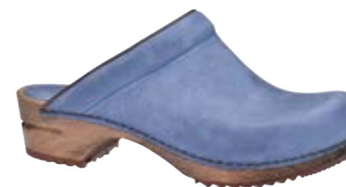
Chrissy // 1200009W // Oil Leather 92 Dove Blue // Size 35-42