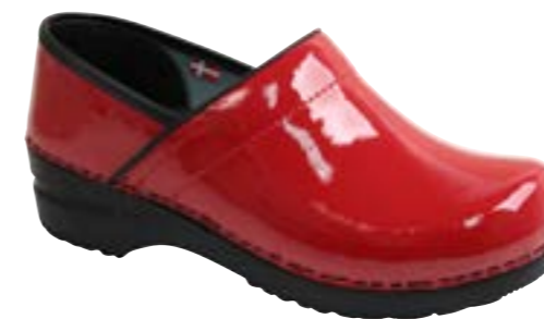
Original-Prof. Patent // 457406W Patent Leather // 4 Red // Size 35-43