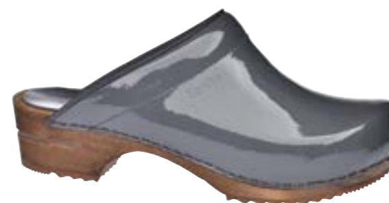
Classic Patent // 457012 // Patent Leather 56 Drak Grey // Size 35-42