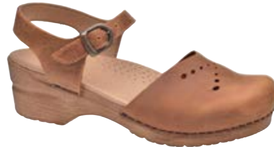
Sella // 474148 // Oil Leather 3 Chestnut // Size 35-42