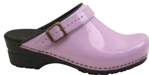
Freya // 457548 // Patent Leather 81 Purple // Size 35-42