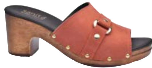
Non Wood Seia // 478763 Suede // 9 Burned Orange // Size 35-42

The tread part is covered with a soft padded footbed to comfort the foot while walking. Sandals and slides in Suede or leather with decorative golden detail or trimming.