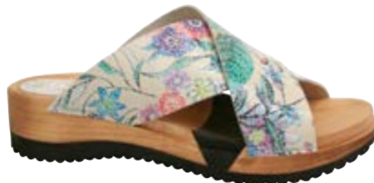
Velo Flex // 476923 Printed Microfibre // 24 Beige // Size 35-42