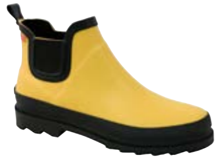
Felicia Welly // 467987 // Natural Rubber 7 Yellow // Size 36-42

Danish design, classical Scandinavian look and feel in our range of wellies Our Chelsea boot is made of NATURAL rubber which is MAX flexible and durable. On rainy days Sanita wellies will keep your feet dry and warm.