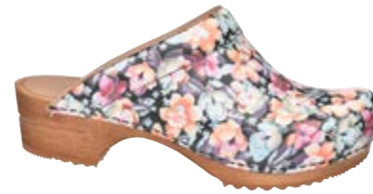
Flok // 472029 // Printed PU Leather 33 Salmon // Size 35-42