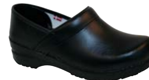
Original-Prof. PU // 1500006W // Size 35-43 Original-Prof. PU // 1500006M // Size 40-48 PU Leather // 2 Black