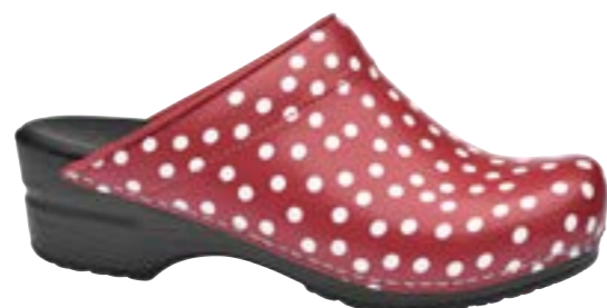
Fenja // 457048 // Printed PU Leather 4 Red // Size 35-42