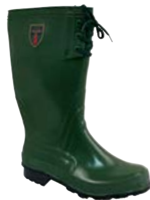
Hunting Boot // 538665 // PVC Rubber 25 Green // Size 35-46