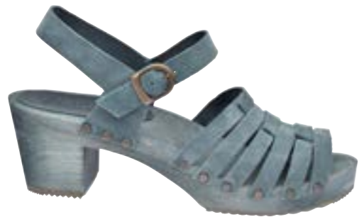
Silo // 476204 Suede // 25 Green Mono // Size 35-42