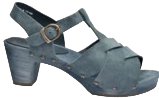
Falo // 478305 Suede // 25 Green Mono // Size 35-42

Our favorite time of the year is bringing light and optimism in life as are the trends and key colours for Spring /Summer 2023. Pleasant and minimalistic expression, monochrome look or colourful prints are brought into play using a variety of materials and silhouettes in our range of clogs and clog sandals.