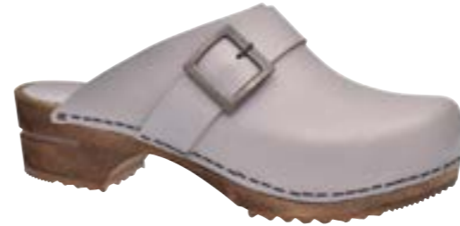
Urban // 453062 // Oil Leather 20 Grey // Size 35-42