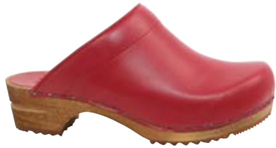
Lotte // 470009W // PU Leather 4 Red // Size 35-42