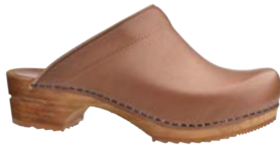
Lotte // 470009W // Size 35-42 Lars // 470009M // Size 40-48 PU Leather // 15 Cognac