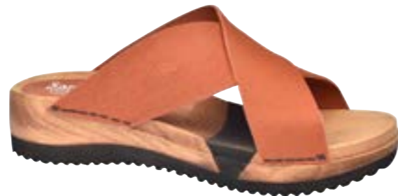
Vesla Flex // 478923 Mushroom // 9 Burned Orange // Size 35-42