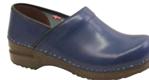
Izabella // 457006W // PU Leather 5 Blue // Size 35-43