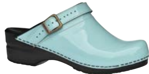
Freya // 457548 // Patent Leather 34 Mint // Size 35-42