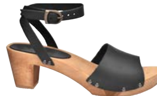
Yara Flex // 457357 Oil Leather // 2 Black // Size 35-42