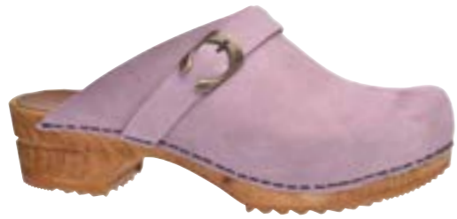
Hedi // 457190 // Suede 59 Light Purple // Size 35-42

The Sanita DNA: Handcrafted Original Danish Clogs since 1907 – more than 110 years of experience in clog making. Comfort and quality are keywords for this wide range of wooden clogs made in a selection of genuine leathers – suede, oiled, patent or printed variation.