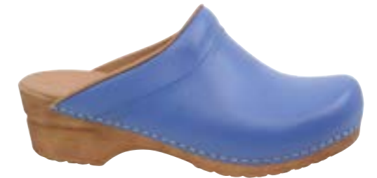
Sandra // 473047 // PU Leather 5 Blue // Size 35-42