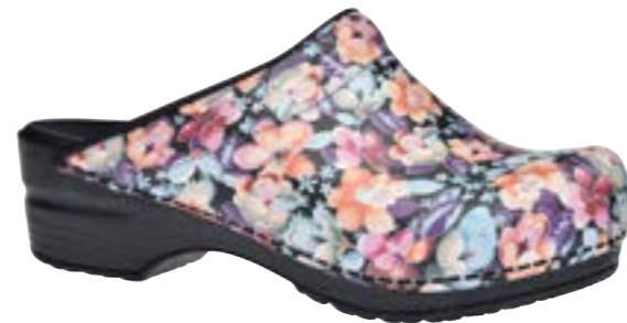
Inalo // 475647 // Printed PU Leather 33 Salmon // Size 35-42