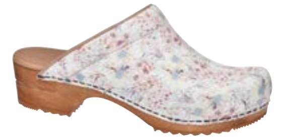
Orchid // 474609 // Printed Leather 34 Mint // Size 35-42