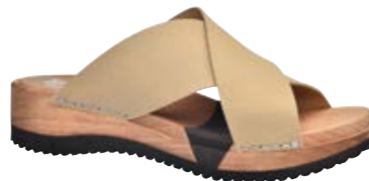
Vesla Flex // 478923 Mushroom // 14 Nature // Size 35-42