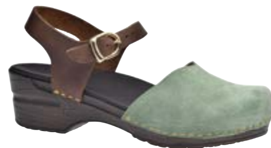
Sanos // 476248 // Suede/Oil Leather 34 Mint // Size 35-42