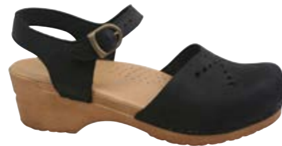
Sella // 474148 // Oil Leather 2 Black // Size 35-42