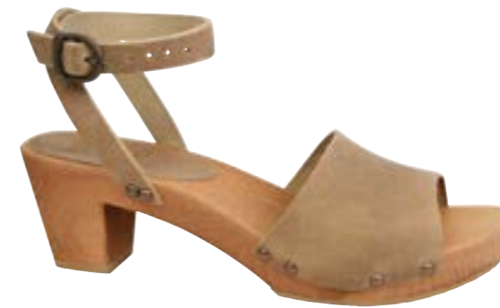
Yara Flex // 457357 Oil Leather // 24 Sand // Size 35-42