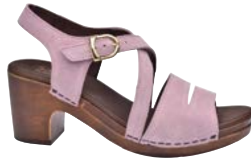
Non Wood Sefica // 478762 Suede // 59 Light Purple // Size 35-42