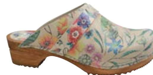
Vegu // 476909 // Printed Microfibre 24 Beige // Size 35-42