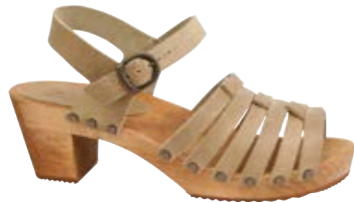
Silo // 476204 Oil Leather // 24 Sand // Size 35-42