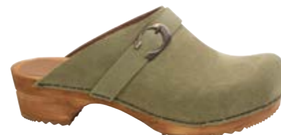
Hedi // 457190 // Suede 43 Green // Size 35-42