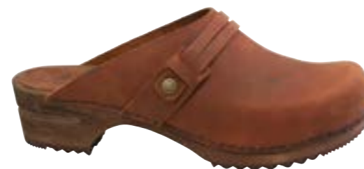
Ursana // 474260 // Oil Leather 3 Chestnut // Size 35-42