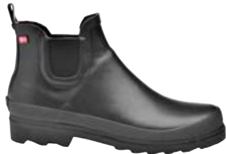
Felicia Welly // 467987 // Natural Rubber 2 Black // Size 36-42