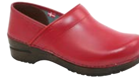
Izabella // 457006W // PU Leather 4 Red // Size 35-43

PU coated leather is split leather (suede) with a Polyurethane foil covering the surface The strong and uniform PU foil is strong and durable and make the clog suitable for work. The surface of the leather can easily be cleaned; even with disinfecting liquid.