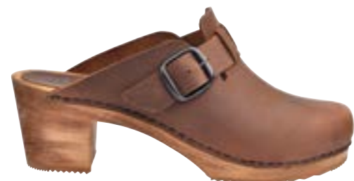
Malulo // 476200 // Oil Leather 3 Chestnut // Size 35-42