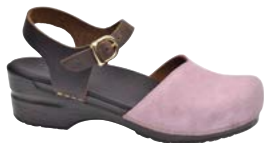
Sanos // 476248 // Suede/Oil Leather 59 Light Purple // Size 35-42