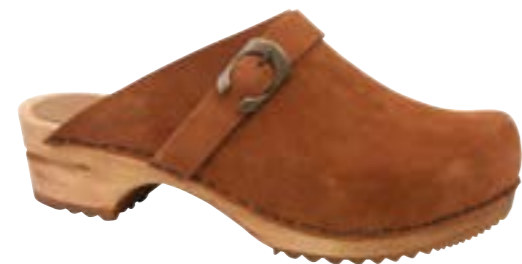
Hedi // 457190 // Suede 15 Cognac // Size 35-42