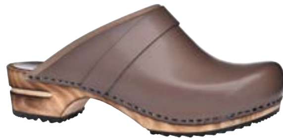
Rikke // 476009 // PU Leather 20 Taupe // Size 35-42