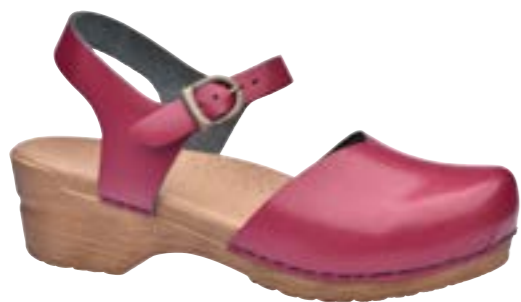
Sansi // 474048 // PU Leather 79 Fuchsia // Size 35-42