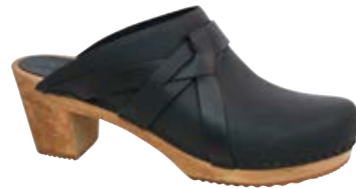
Manuella // 472200 // Oil Leather 2 Black // Size 35-42