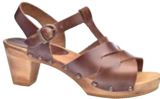
Falo // 478305 Pull Up Leather // 3 Brown // Size 35-42