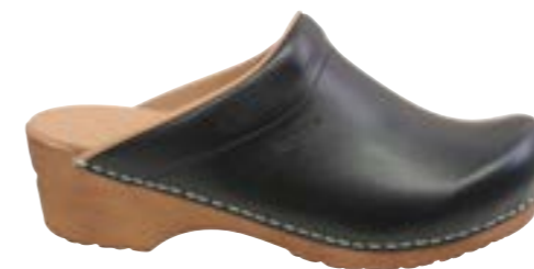
Sandra // 473047 // PU Leather 2 Black // Size 35-42