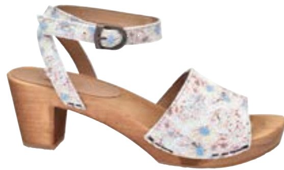
Otium Flex // 474619 Printed Leather // 34 Mint // Size 35-42