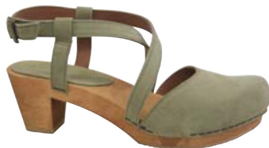
Linja Flex // 474107 Suede // 43 Green // Size 35-42