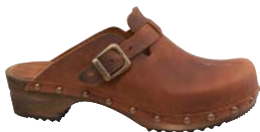
Kristel // 455205W // Oil Leather 3 Chestnut // Size 35-42