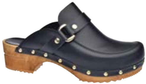
Lillen // 478340 // Leather 2 Black // Size 35-42