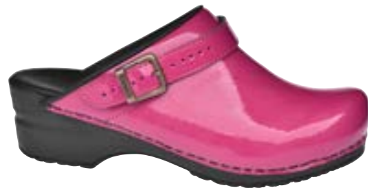
Freya // 457548 // Patent Leather 79 Fuchsia // Size 35-42