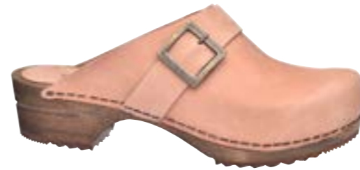
Urban // 453062 // Oil Leather 33 Salmon // Size 35-42