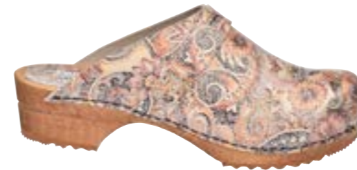
Vegu // 476909 // Printed Microfibre 9 Burned Orange // Size 35-42