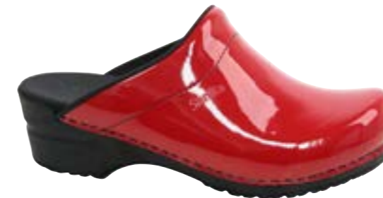
Sonja Patent // 450447 // Patent Leather 4 Red // Size 35-43