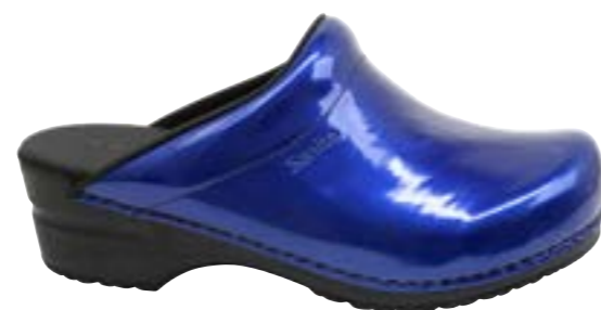
Metallic // 1990049 // Metallic Patent Leather 5 Blue // Size 35-43