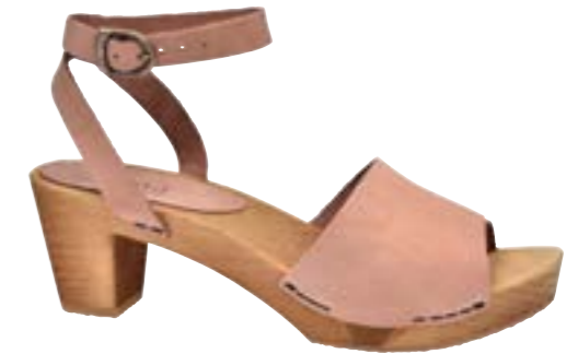
Yara Flex // 457357 Oil Leather // 33 Salmon // Size 35-42