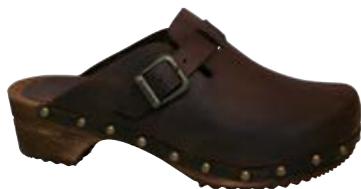
Kristel // 455205W // Oil Leather 78 Ant. Brown // Size 35-42