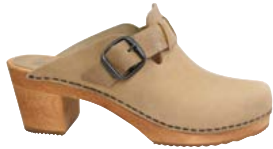
Malulo // 476200 // Oil Leather 24 Sand // Size 35-42

Sanita classic mule style on a 7 cm heeled lime tree outsole.