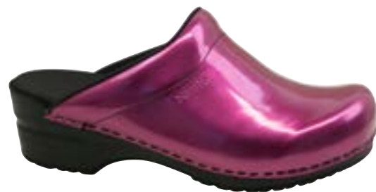
Metallic // 1990049 // Metallic Patent Leather 32 Purple // Size 35-43