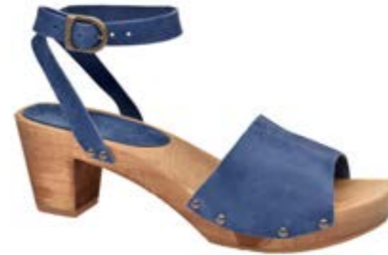
Yara Flex // 457357 Oil Leather // 92 Dove Blue // Size 35-42