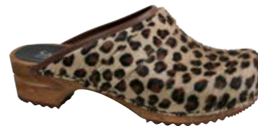
Caroline // 1706199W // Cow Fur 87 Leopard // Size 35-42