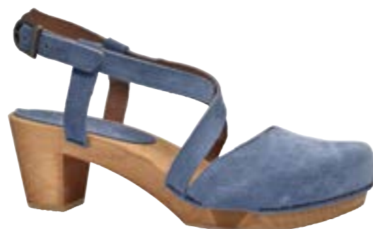
Linja Flex // 474107 Suede // 92 Dove Blue // Size 35-42