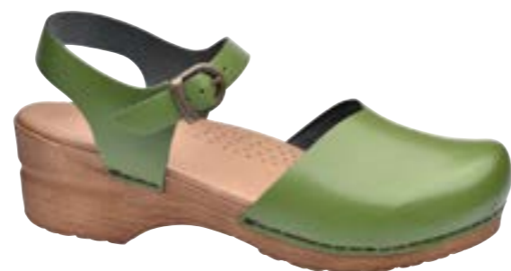
Sansi // 474048 // PU Leather 25 Green // Size 35-42