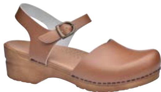
Sansi // 474048 // PU Leather 15 Cognac // Size 35-42