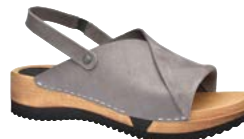
Vida Flex // 478111 Reverse Suede // 24 Taupe // Size 35-42