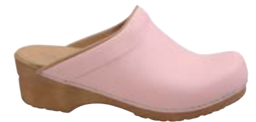
Sandra // 473047 // PU Leather 65 Pink // Size 35-42