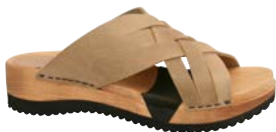
Salto Flex // 476220 Oil Leather // 24 Sand // Size 35-42