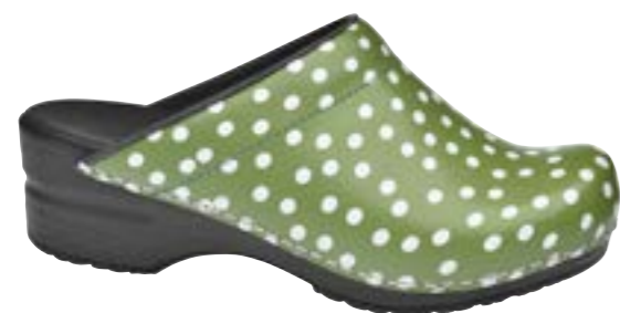
Fenja // 457048 // Printed PU Leather 25 Green // Size 35-42