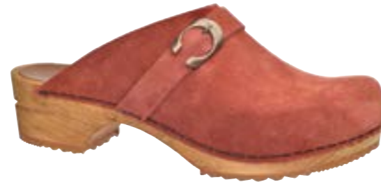
Hedi // 457190 // Suede 9 Burned Orange // Size 35-42