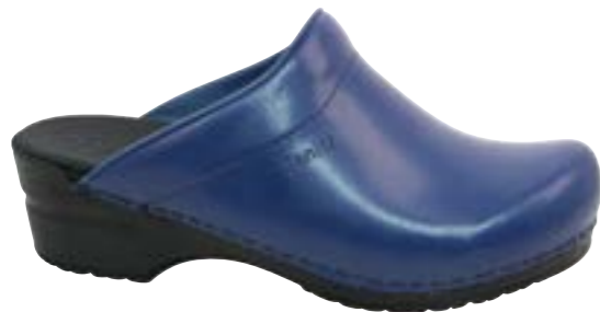
Sonja PU // 1500047 // PU Leather 55 Denim // Size 35-43