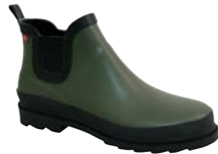
Felicia Welly // 467987 // Natural Rubber 64 Olive // Size 36-42