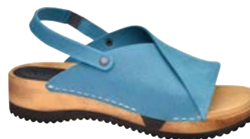
Vida Flex // 478111 Reverse Suede // 8 Turquoise // Size 35-42