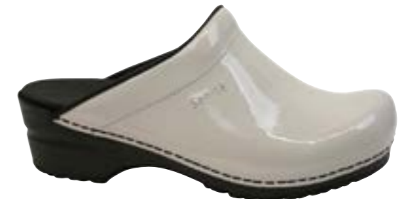
Sonja Patent // 450447 // Patent Leather 73 Light Grey // Size 35-43