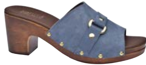
Non Wood Seia // 478763 Suede // 92 Dove Blue // Size 35-42