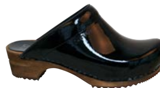
Classic Patent // 457012 // Patent Leather 2 Black // Size 35-42