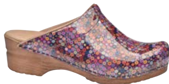
Illo // 477647 // Printed Patent Leather 9 Burned Orange // Size 35-42