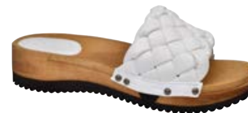
Vola Flex // 478011 Soft Padded Pu Leather // 11 Off White // Size 35-42