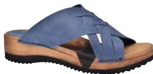
Salto Flex // 476220 Oil Leather // 92 Dove Blue // Size 35-42