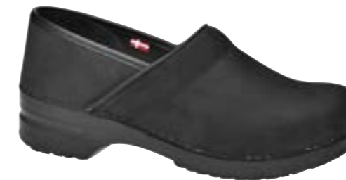
Original-Prof. Textured Oil // 450206W // Size 35-43 Original-Prof. Textured Oil // 450206M // Size 40-48 WR Oil Leather // 2 Black