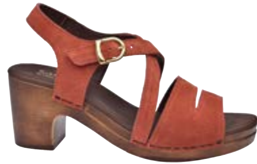
Non Wood Sefica // 478762 Suede // 9 Burned Orange // Size 35-42