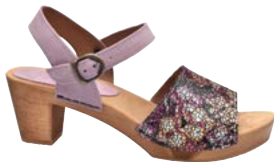
Osa Flex // 478107 Suede/Printed Suede // 59 Light Purple // Size 35-42