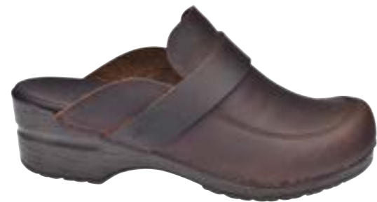
Knaus // 478251 // Size 35-43 78 Ant. Brown // Oil Leather