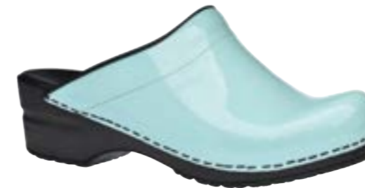
Sonja Patent // 450447 // Patent Leather 34 Mint // Size 35-43