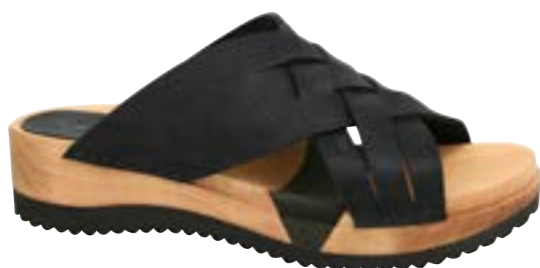
Salto Flex // 476220 Oil Leather // 2 Black // Size 35-42