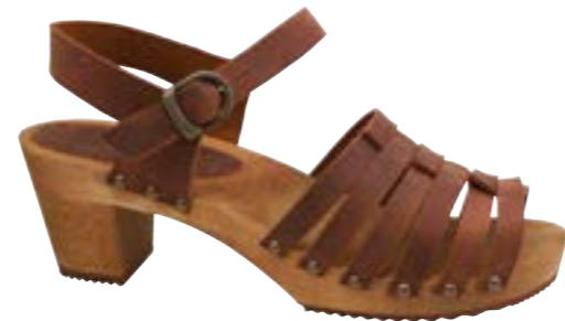
Silo // 476204 Oil Leather // 3 Chestnut // Size 35-42