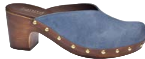
Non Wood Selta // 478761 Suede // 92 Bove Blue// Size 35-42