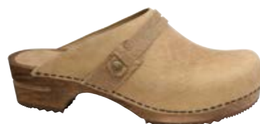
Ursana // 474260 // Oil Leather 24 Sand // Size 35-42