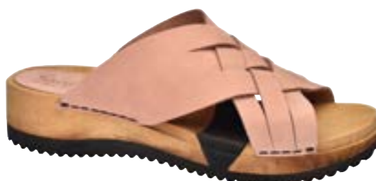
Salto Flex // 476220 Oil Leather // 33 Salmon // Size 35-42