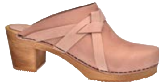
Manuella // 472200 // Oil Leather 33 Salmon // Size 35-42