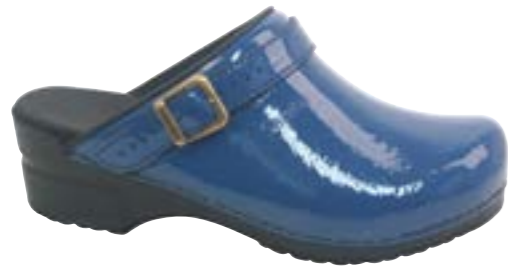
Freya // 457548 // Patent Leather 5 Denim // Size 35-42

Selection of colourful printed patent coated leather - easy to clean.