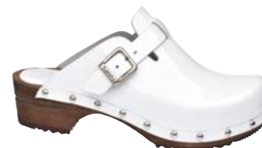
Krisla // 478005 // Patent Leather 1 White // Size 35-42