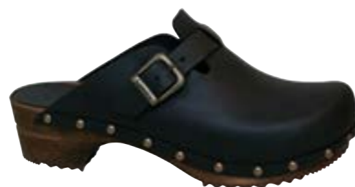
Kristel // 455205W // Oil Leather 2 Black // Size 35-42