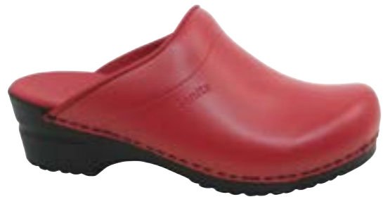
Sonja PU // 1500047 // PU Leather 4 Red // Size 35-43

The iconic ORIGINAL CLOG STYLE was patented by Sanita and launched in 1988 The original outsole is constructed with an invisible frame stabilizing the shape and securing the staples. An anatomical shaped and soft padded footbed provide max comfort to the foot cushioning every step.