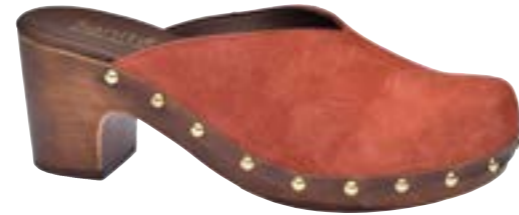
Non Wood Selta // 478761 Suede // 9 Burned Orange // Size 35-42