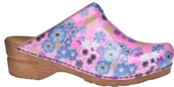
Isalena // 457618 // Printed Patent Leather 13 Pink // Size 35-42