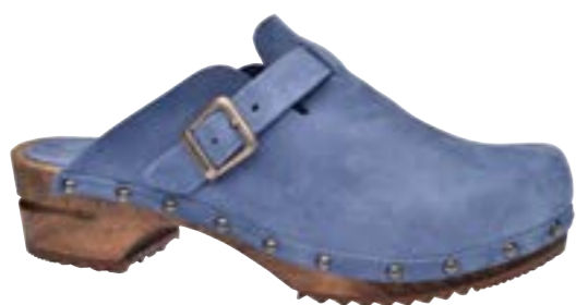
Kristel // 455205W // Oil Leather 92 Dove Blue // Size 35-42