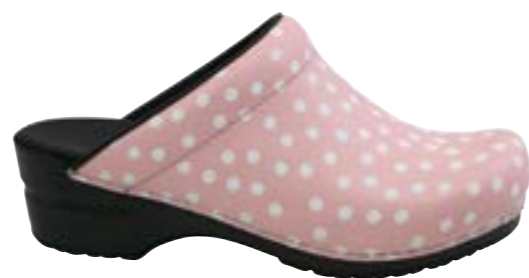
Fenja // 457048 // Printed PU Leather 65 Rose // Size 35-42