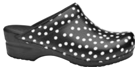
Fenja // 457048 // Printed PU Leather 2 Black // Size 35-42