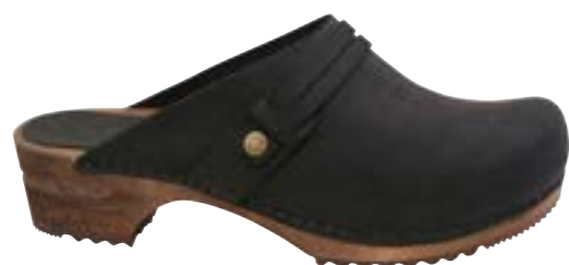
Ursana // 474260 // Oil Leather 2 Black // Size 35-42