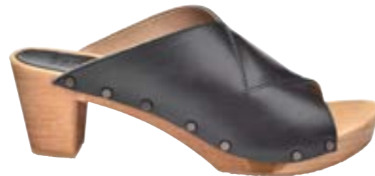
Kelo Flex // 478411 Soft Leather // 2 Black // Size 35-42