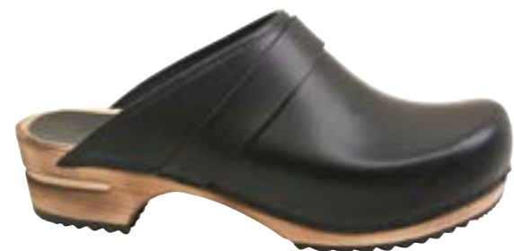
Rikke // 476009 // PU Leather 2 Black // Size 35-42