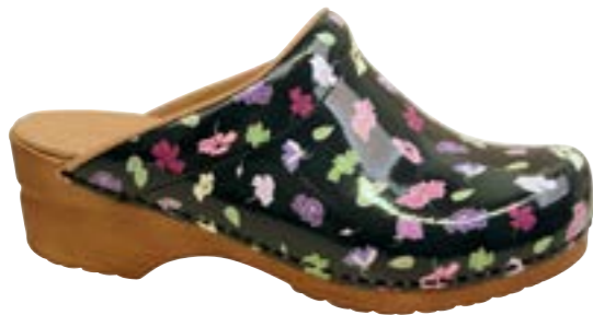
Illo // 477647 // Printed Patent Leather 2 Black // Size 35-42