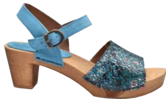
Osa Flex // 478107 Suede/Printed Suede // 8 Turquoise // Size 35-42