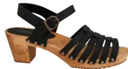
Silo // 476204 Oil Leather // 2 Black // Size 35-42