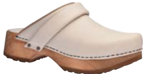
Chuso // 477495 // Soft Leather 11 Off White // Size 35-42