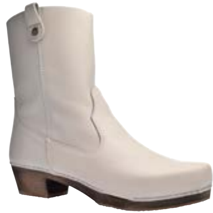
Kit Flex Western // 477383 // Soft Leather 11 Off White // Size 35-42

A versatile collection of boots, clogs and sandals which by its' cushioned padded details emphasizes the soft look and feel of real nappa leather.