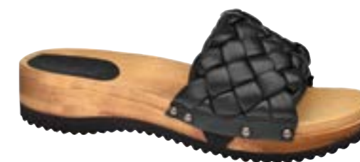
Vola Flex // 478011 Soft Padded Pu Leather // 2 Black // Size 35-42