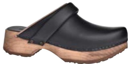
Chuso // 477495 // Soft Leather 2 Black // Size 35-42