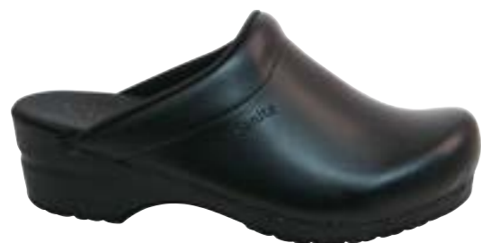
Sonja PU // 1500047 // Size 35-43 Sonja PU Wide // 1500147 // Size 35-43 Karl PU // 1500050 // Size 40-48 PU Leather // 2 Black