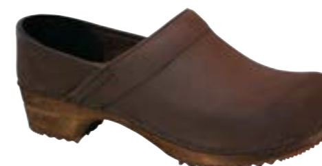
Julie // 1201005W // Size 35-42 Jamie // 1201005M // Size 40-48 Oil Leather // 78 Ant. Brown