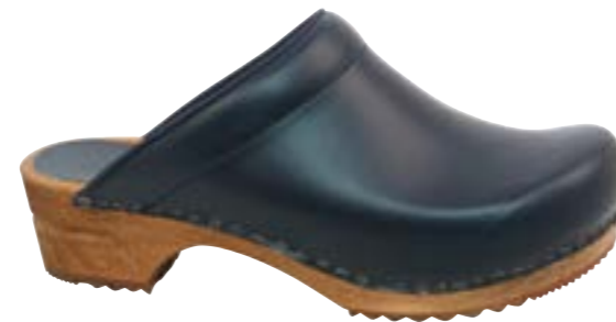
Lotte // 470009W // Size 35-42 Lars // 470009M // Size 40-48 PU Leather // 5 Blue