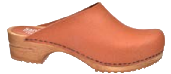
Vegor // 477962 // Mushroom 9 Burned Orange // Size 35-42