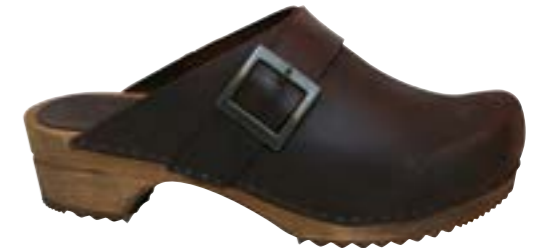
Urban // 453062 // Oil Leather 78 Ant. Brown // Size 35-42