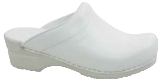
Sonja PU // 1500047 // Size 35-43 Sonja PU Wide // 1500147 // Size 35-43 Karl PU // 1500050 // Size 40-48 PU Leather // 1 White