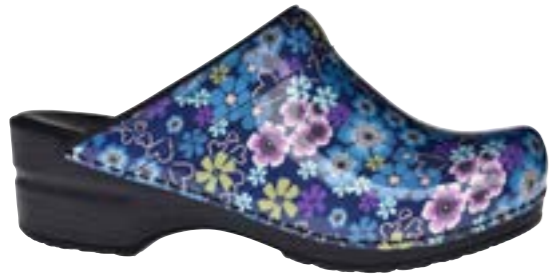
Isalena // 457618 // Printed Patent Leather 29 Navy // Size 35-42