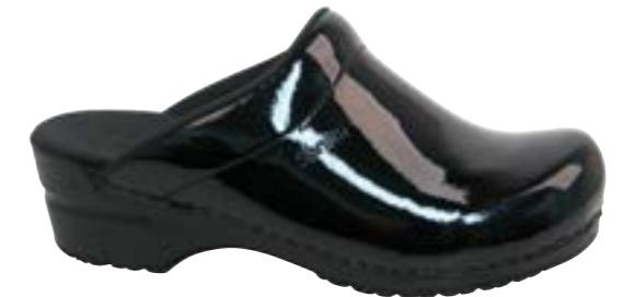
Sonja Patent // 450447 // Patent Leather 2 Black // Size 35-43