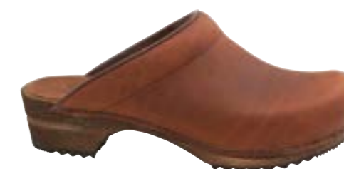
Chrissy // 1200009W // Size 35-42 Christian // 1200009M // Size 40-48 Oil Leather // 3 Chestnut