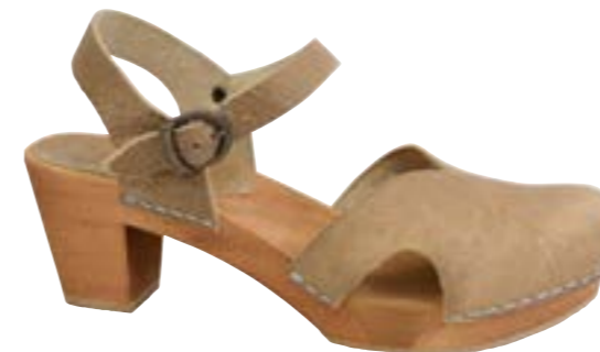
Matrix Flex // 451207 Oil Leather // 24 Sand // Size 35-42