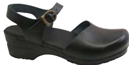
Sansi // 474048 // PU Leather 2 Black // Size 35-42