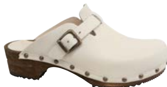
Kristel // 455205W // Leather 1 White // Size 35-42