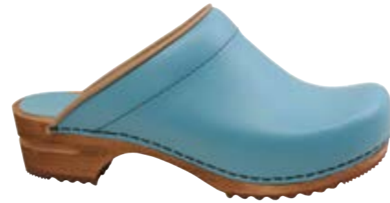
Lotte // 470009W // PU Leather 19 Teal // Size 35-42