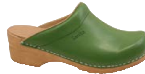
Sandra // 473047 // PU Leather 25 Green // Size 35-42