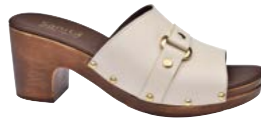
Non Wood Seia // 478763 Leather // 11 Off White // Size 35-42