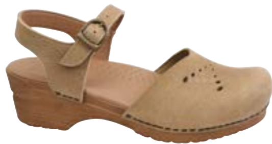
Sella // 474148 // Oil Leather 24 Sand // Size 35-42