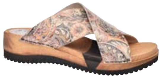
Velo Flex // 476923 Printed Microfibre // 9 Burned Orange // Size 35-42