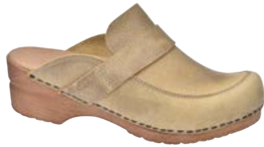
Knaus // 478251 // Size 35-43 24 Sand // Oil Leather

Our ORIGINAL Danish clogs made with PU (Polyurethane) soles for soft and comfortable all-day wear. Max comfort and support from the soft padded footbed. For fashion as well as professional use. The range vary from open back style with convertible straps to closed back: the iconic ORIGINAL CLOG STYLE.