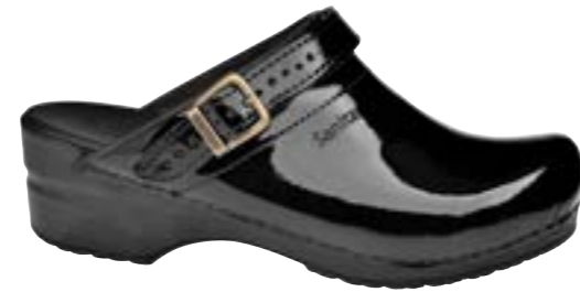
Freya // 457548 // Patent Leather 2 Black // Size 35-42