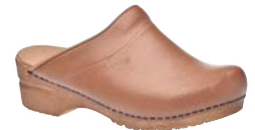
Sandra // 473047 // PU Leather 15 Cognac // Size 35-42