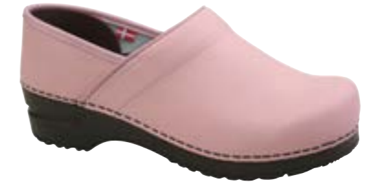
Izabella // 457006W // PU Leather 65 Pink // Size 35-43