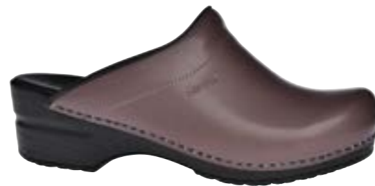
Sonja PU // 1500047 // PU Leather Karl PU // 1500050 // Size 40-48 24 Taupe // Size 35-43