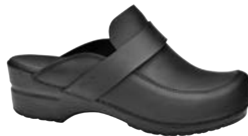
Knaus // 478251 // Size 35-43 2 Black // Oil Leather