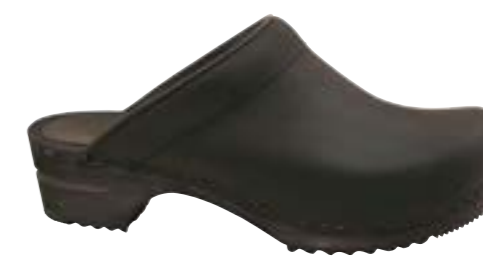
Chrissy // 1200009W // Size 35-42 Christian // 1200009M // Size 40-48 Oil Leather // 2 Black