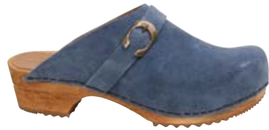
Hedi // 457190 // Suede 92 Dove Blue // Size 35-42