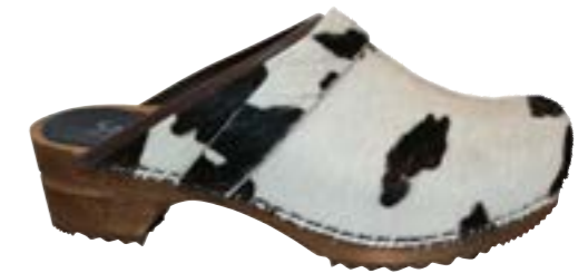
Caroline // 1706199W // Size 35-42 Casper // 1706199M // Size 40-48 Cow Fur // 3 Brown Cow