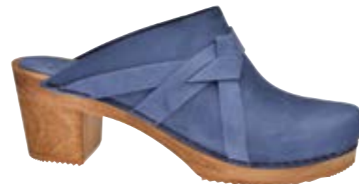
Manuella // 472200 // Oil Leather 92 Dove Blue // Size 35-42