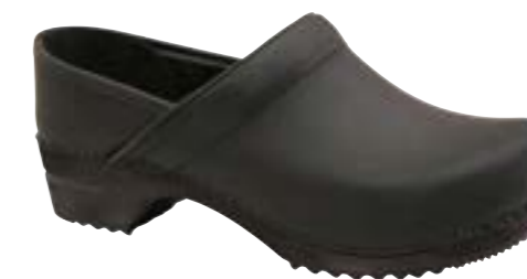
Julie // 1201005W // Size 35-42 Jamie // 1201005M // Size 40-48 Oil Leather // 2 Black