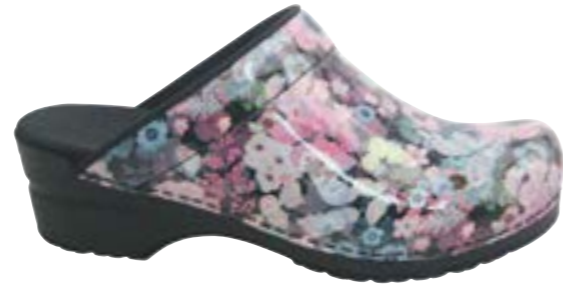
Isalena // 457618 // Printed Patent Leather 65 Rose Print // Size 35-42