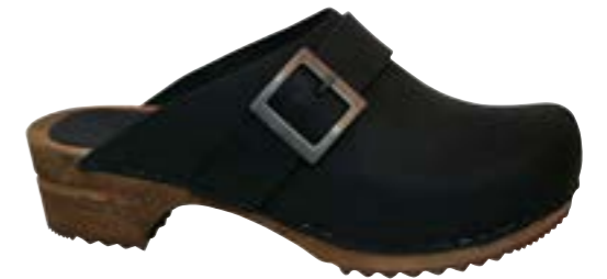
Urban // 453062 // Oil Leather 2 Black // Size 35-42