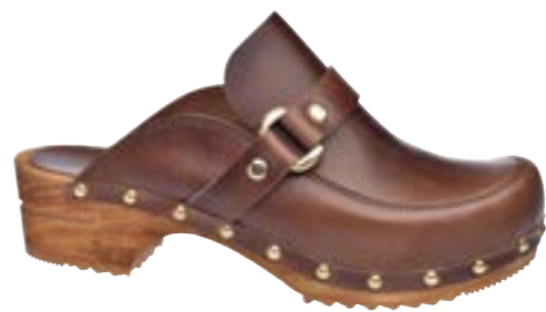
Lillen // 478340 // Leather 3 Brown // Size 35-42