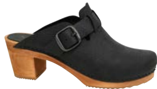
Malulo // 476200 // Oil Leather 2 Black // Size 35-42