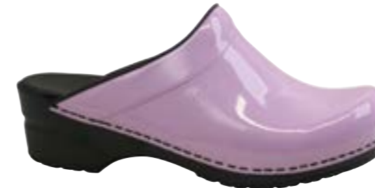
Sonja Patent // 450447 // Patent Leather 32 Purple // Size 35-43

Open or closed back original Sanita clog in water proof and cleanable patent coated leather.