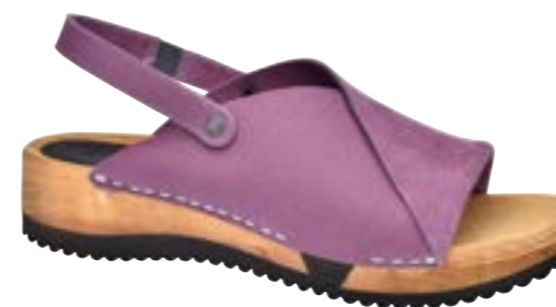
Vida Flex // 478111 Reverse Suede // 59 Light Purple // Size 35-42