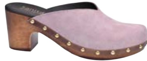
Non Wood Selta // 478761 Suede // 59 Light Purple // Size 35-42