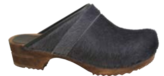
Casper // 1706199M // Size 40-48 Cow Fur // 56 Steel