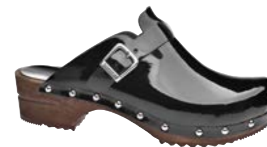
Krisla // 478005 // Patent Leather 2 Black // Size 35-42