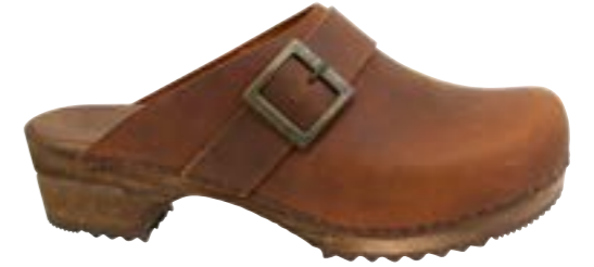
Urban // 453062 // Oil Leather 3 Chestnut // Size 35-42