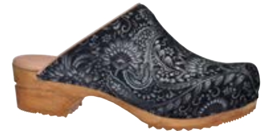
Soldi // 477109 // Printed Suede 29 Blue Paisley // Size 35-42