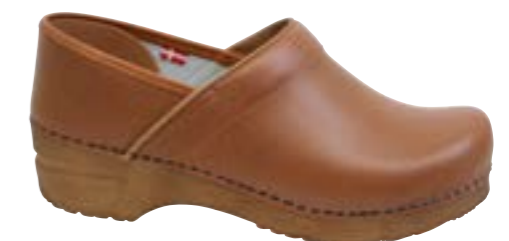
Pila // 476006 // PU Leather 15 Cognac // Size 35-42