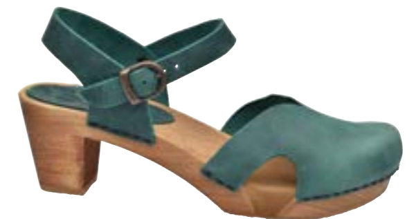
Matrix Flex // 451207 Oil Leather // 77 Dark Green // Size 35-42