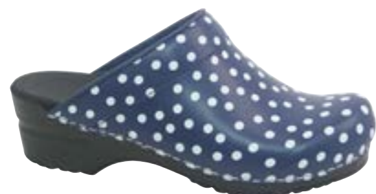
Fenja // 457048 // Printed PU Leather 5 Blue // Size 35-42