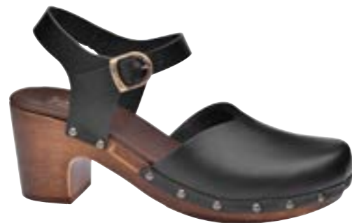
Non Wood Solaima // 478764 Leather // 2 Black // Size 35-42