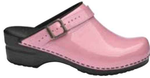
Freya // 457548 // Patent Leather 65 Rose // Size 35-42