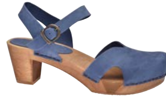
Matrix Flex // 451207 Oil Leather // 92 Dove Blue // Size 35-42