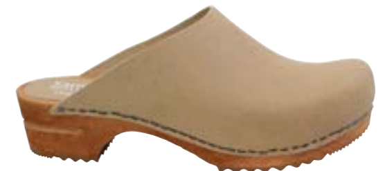
Vegor // 477962 // Mushroom 14 Nature // Size 35-42