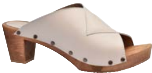
Kelo Flex // 478411 Soft Leather // 11 Off White // Size 35-42