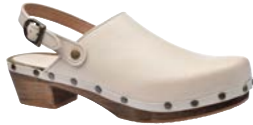
Kul Flex Western // 478382 // Soft Leather 11 Off White // Size 35-42