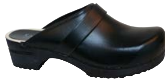
Rita // 1500199W // Size 35-42 Ralph // 1500199M // Size 40-48 PU Leather // 2 Black