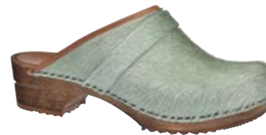
Caroline // 1706199W // Cow Fur 34 Mint // Size 35-42