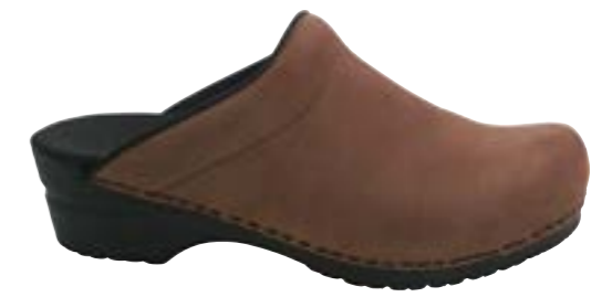
Sonja Textured Oil // 450247 // Size 35-43 Karl Textured Oil // 450250 // Size 40-48 WR Oil Leather // 78 Ant. Brown