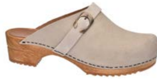
Hedi // 457190 // Suede 24 Beige // Size 35-42