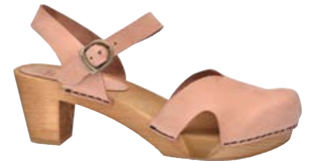
Matrix Flex // 451207 Oil Leather // 33 Salmon // Size 35-42