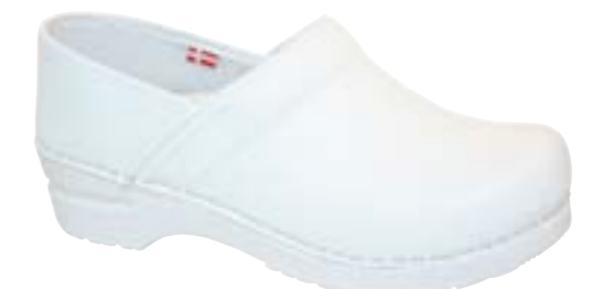
Original-Prof. PU // 1500006W // Size 35-43 Original-Prof. PU // 1500006M // Size 40-48 PU Leather // 1 White