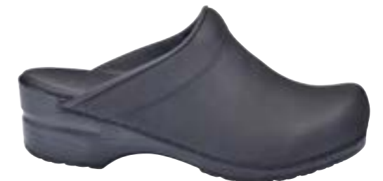
Sonja Textured Oil // 450247 // Size 35-43 Karl Textured Oil // 450250 // Size 40-48 WR Oil Leather // 2 Black