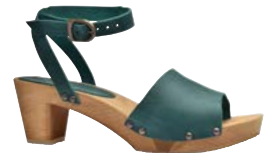
Yara Flex // 457357 Oil Leather // 77 Dark Green // Size 35-42