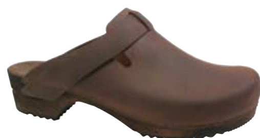
Karsten // 476505 // Oil Leather 78 Ant. Brown // Size 40-48